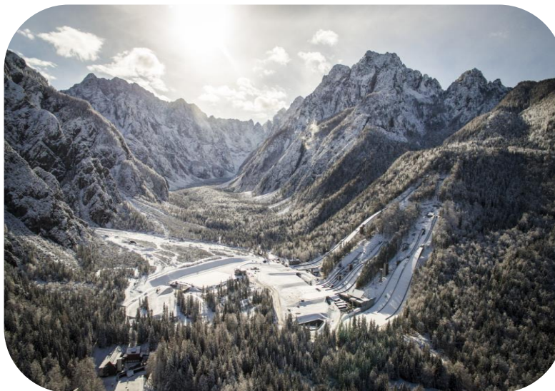
NORDIC CENTER PLANICA