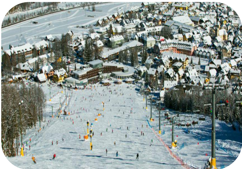
SKI RESORT KRANJSKA GORA